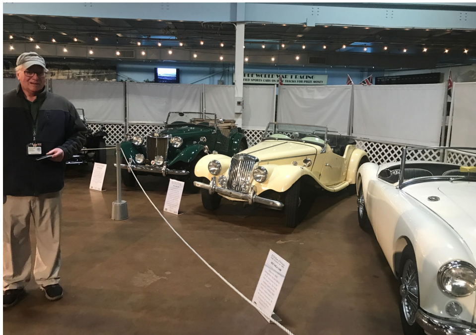
Three Ts and an A