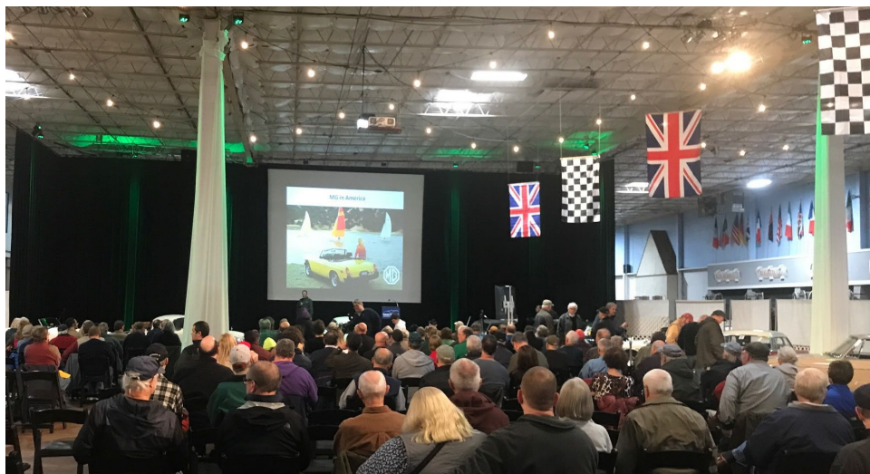
MGs in America