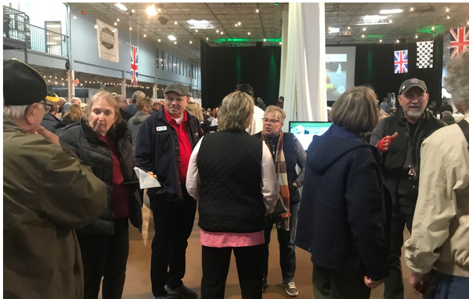
Some of the LANCO Crew