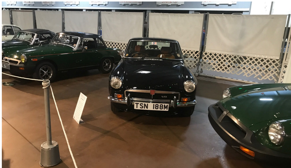
Midgets and MGBs