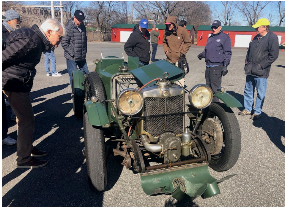
A Closer Look