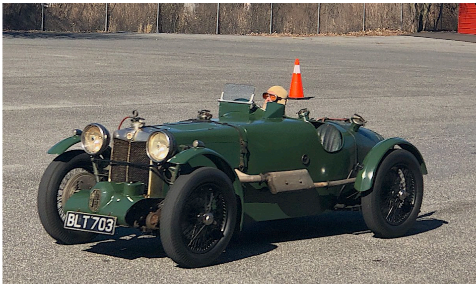
MG K3 on the Move