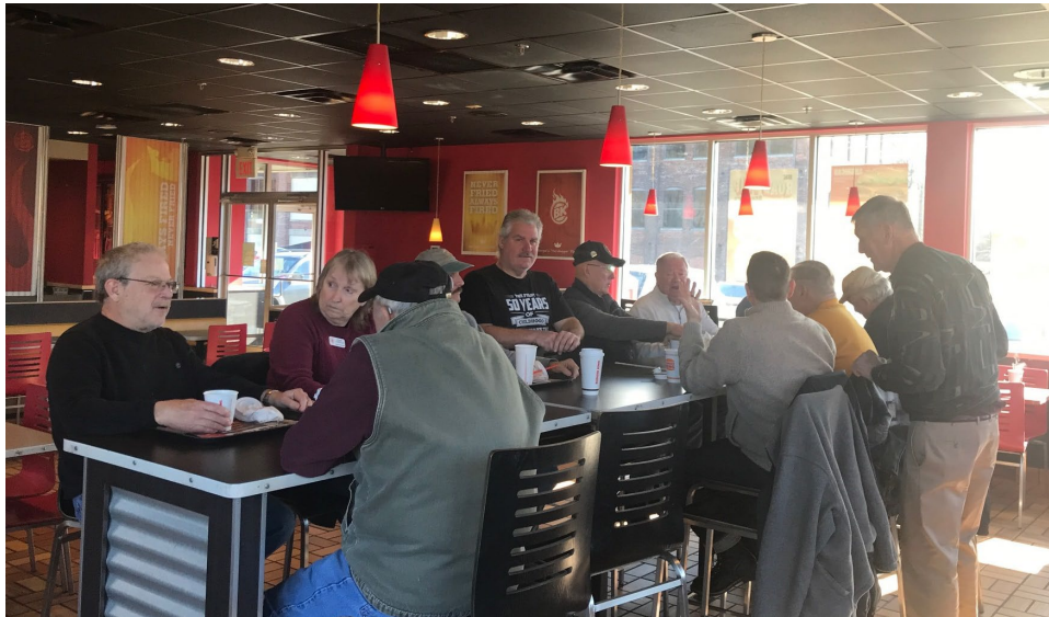
Familiar (and some new) faces