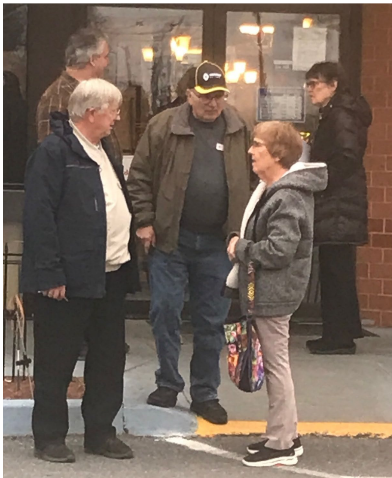
After Dinner Chat